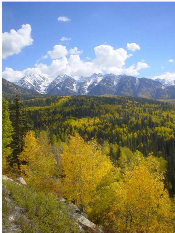
The San Juan Mountains in the fall outside of Durango.