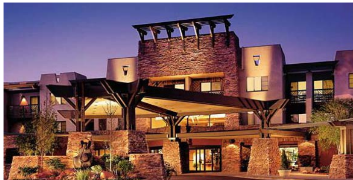
The Hilton Sedona Resort and Spa, a full-service meeting facility.

The 2011 SORCE Symposium will take place at the beautiful Hilton Sedona Resort , just 90 miles north of Phoenix, Arizona. The Resort is nestled in a dramatic Red Rock setting that ranges from nearby creeks surrounded by piñon pines to ancient Sinagua ruins of mystical beauty. The meeting facilities are first-class and attendees will be inspired with the dramatic vistas. For further information on this special venue, you can visit their website at http://www.hiltonsedonaresort.com/ . Information on making your hotel reservations, registration, and logistics will be posted to the SORCE Meeting site in a couple months.