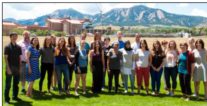
REU class of 2016 enjoying the sunshine in Boulder.