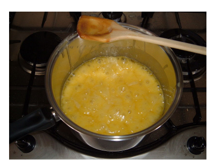
The molten outer core of the Earth convects, or boils, like a pot full of soup.

The Sun produces a solar wind that carries charged particles from the Sun out into the Solar System. Earth's magnetic field protects our planet's surface and atmosphere from these particles by either deflecting