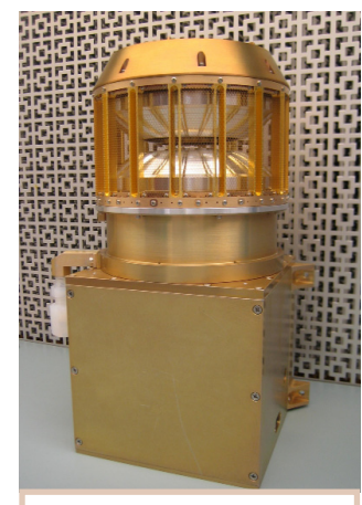
One of the instruments in the Particles and Fields Package.

MAVEN will address another crucial question: How much water did Mars have early on? Hydrogen is a component of water (H<sub>2</sub>O). When water evaporates, water vapor may reach the upper atmosphere where ultraviolet light from the Sun can break apart the molecule into two hydrogen atoms and an oxygen atom. Measuring hydrogen in the atmosphere gives an indication of how much water a planet had in the past. Two